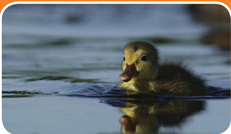
Nature: An Original Duckumentary