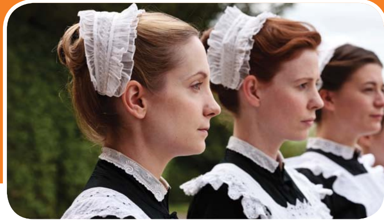
Masterpiece Classic: Downton Abbey, Season 2

All programs are on both 34.1 and 34.2 unless noted.