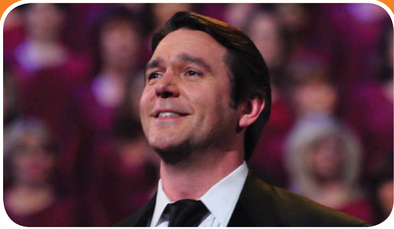
Christmas with the Mormon Tabernacle Choir featuring Jane Seymour and Nathan Gunn