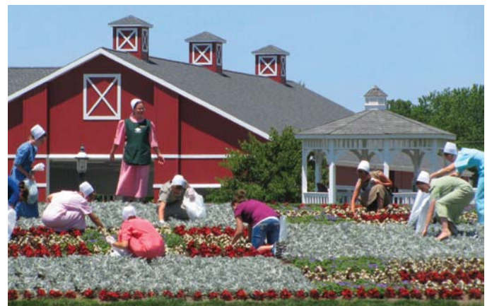
Volunteers plant the Quilt Garden at the Farmstead Inn in Shipshewana, one of 19 on the 2012 Quilt Gardens along the Heritage Trail. The project is sponsored by the Elkhart County CVB in partnership with seven host communities.