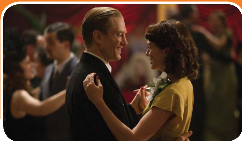
Masterpiece Classic: Upstairs, Downstairs, Series 2

All programs are on both 34.1 and 34.2 unless noted.