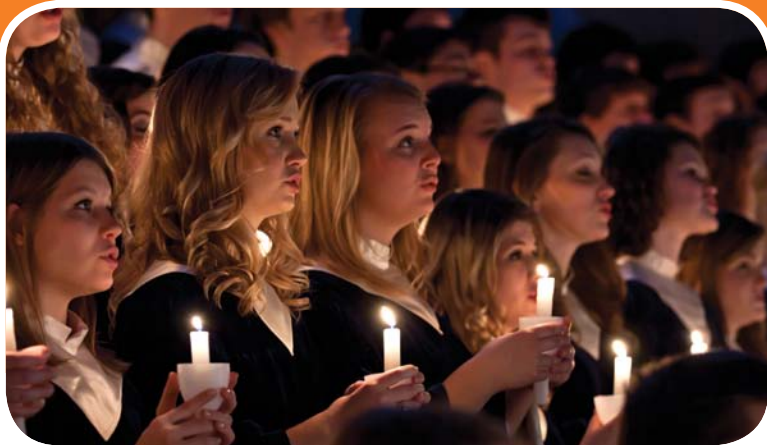
Christmas at Luther