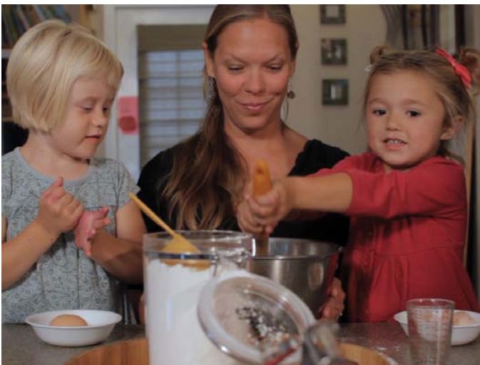
Students from Wee Friends pre-school program and their instructor learn how to share and use resources to maximize their needs as part of the PNC program For Me, For You, For Later.

In 2012 PBS won 33 Emmy Awards—more than any other broadcast or cable outlet.