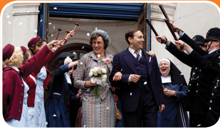
Call the Midwife