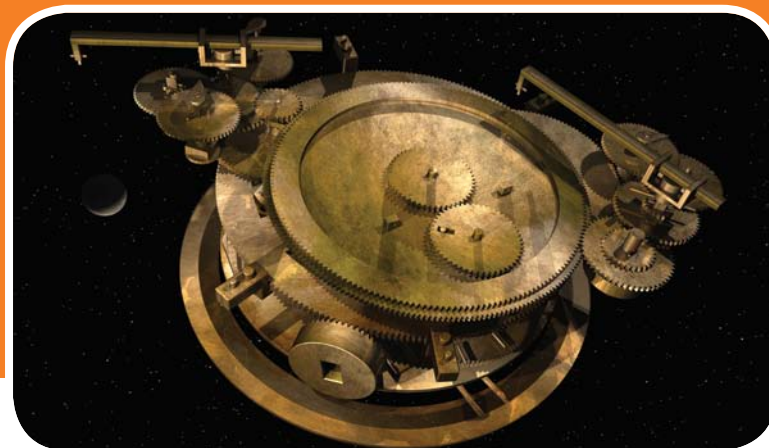
NOVA: Ancient Computer