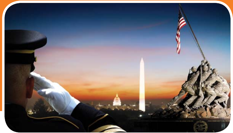
National Salute to Veterans (2012)