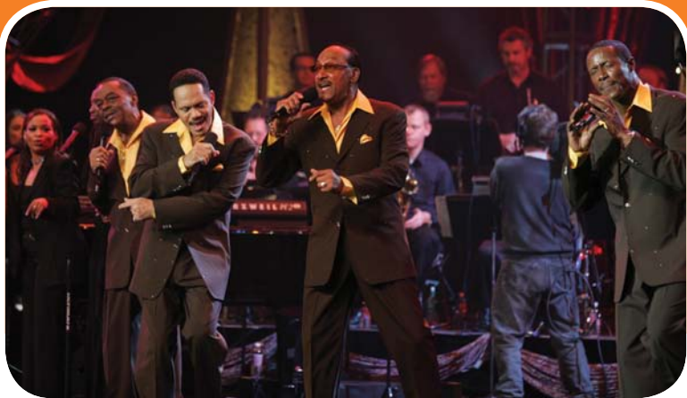
Motown: Big Hits and More (My Music)