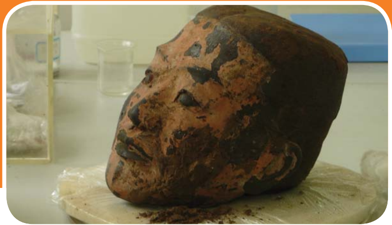
Secrets of the Dead: China's Terracotta Warriors