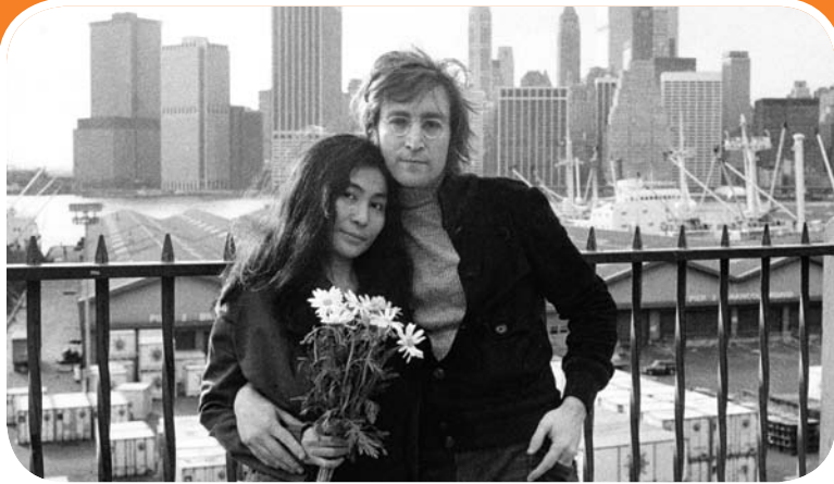
American Masters: LENNONYC