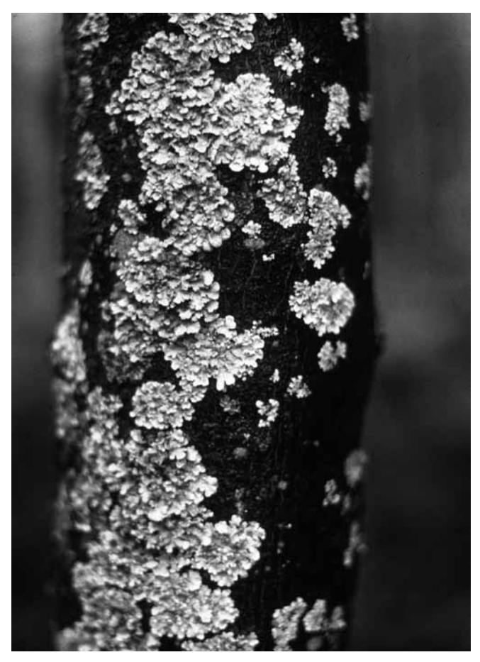
Trees help support many other living organisms, including these lichens. Far from harming the tree, lichens indicate pollution-free air.

At each of the 4 directions, place the 100-Circle Grid Transparency against the tree, and count the number of circles in which lichens are showing. That number represents the percentage of lichen coverage. For each tree, find the average lichen coverage by totaling the lichens found within the circles and then dividing the total by 4. Find the total average lichen coverage of the plot.