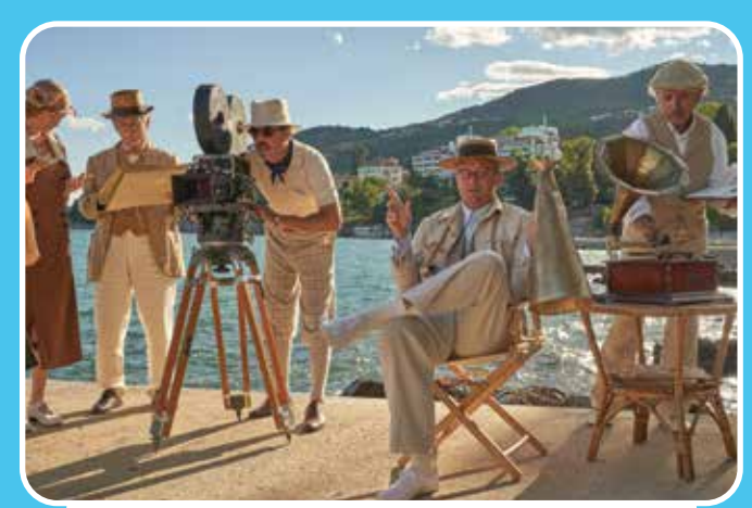
Don't miss Hotel Portofino: Touring Portofino November 26 at 8pm on 34.1!

Programming is amazing not to mention educational! Phil – Kouts, Indiana